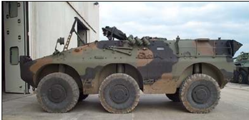
6x6 Puma VBL

The Italian Army originally held a procurement objective of 2,000 Puma vehicles, in both the 4x4 and 6x6 configurations. However, fiscal constraints forced the Army to reduce the objective to 580 units. Iveco reportedly completed this truncated production run in 2004, as scheduled. The Forecast International Weapons Group expects the Italian Army will place at least one follow-on order during the forecast period.