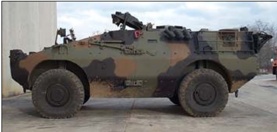
4x4 Puma VBL

Modernization and Retrofit Overview. Not applicable at this time.